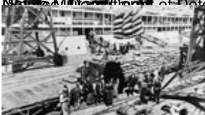
South Africa for a (South Africa) by Italian troops in Ethiopia