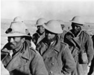
British soldiers from the 1st Airborne Division in the North African desert