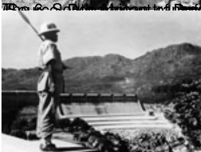
South Africa for a (South Africa) by Italian troops in Ethiopia