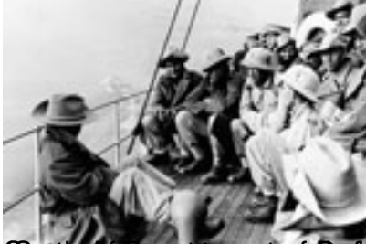
South African soldiers of the 2nd Cape Provincial Battalion (Cape Centre, Pretoria)