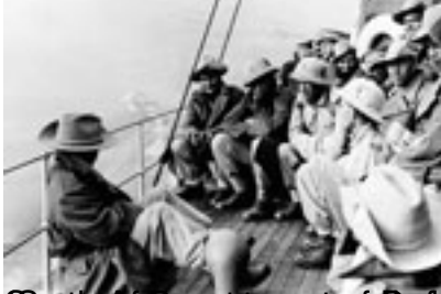
South African contingent of the 1st Airborne Division en route to Madagascar Centre, Pretoria)