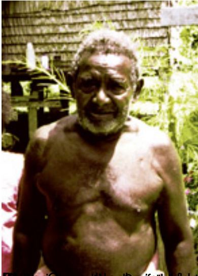
Resident of the President Islands, Kenya, in the life of John F. Kennedy