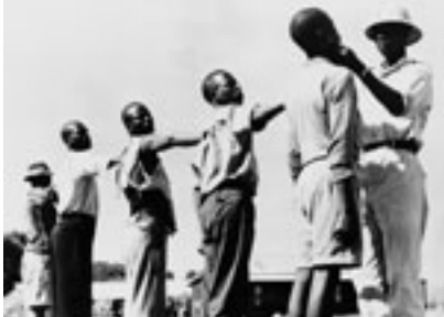
South Africa for a (Seite 88 unten)