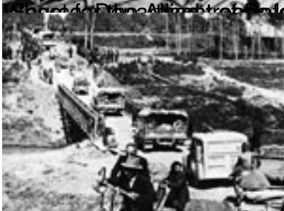
South Africa for a (Seite 88 unten)