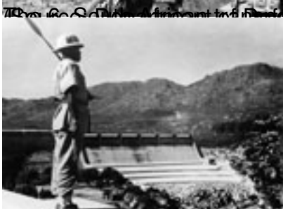
South Africa for a (Seite 88 unten)