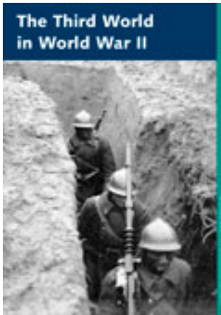
Panel with title of the exhibition

In this site we provide some of the panels and some of the used fotos of the exhibition for media coverage. These pictures are free to use as far as they are used in the context of media coverage on the projekt "The Third World in World War II". To get the high resolution pictures please right click at a picture and chose "save target as..." (or similar)