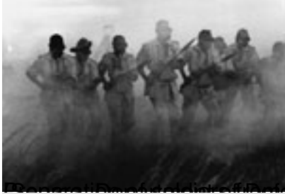
South Africa for a (Seite 88 unten)