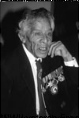
... als Fahrer in der Schlacht von Sidi Rezegh in Nordafrika)