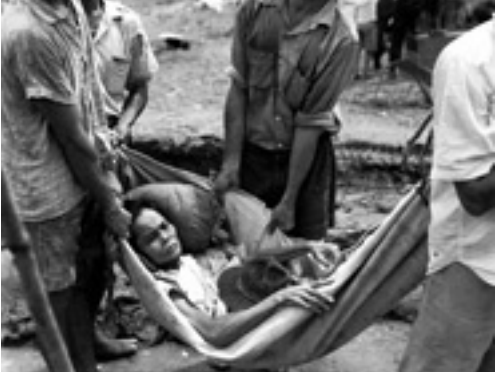
(South Pacific) A Chaco, to Somalia (the) liberation of Guam from Japanese occupation