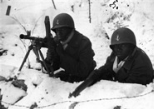
(Colonial Soldiers from Africa) in winter 1944 in Northern France