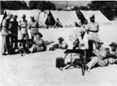
Training of soldiers of the Cape Corps