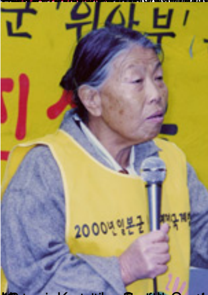
Photo of an elderly woman speaking into a microphone. Caption: She was abducted and abused by the Japanese Military at the age of