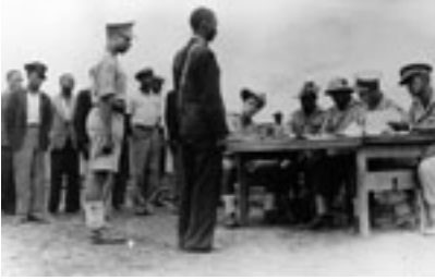
May 1940: Recruiting of Cape Corps volunteers