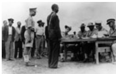
May 1940: Recruiting of Cape Corps volunteers