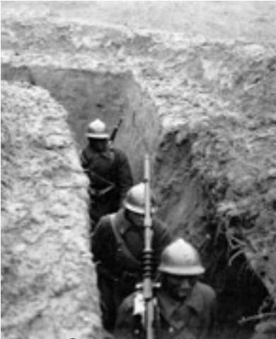
(1930s) Colonial Soldiers from Africa in French trenches