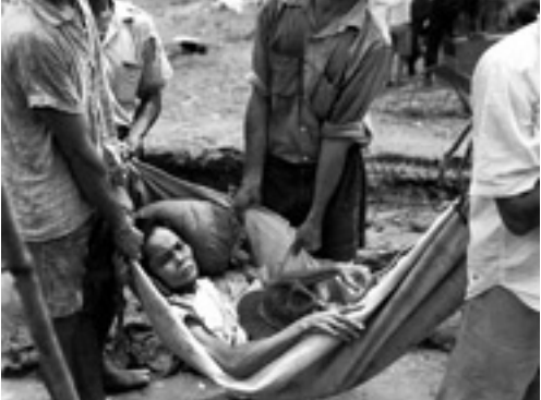
(South Pacific 1944) Charges to Somalia (1945) liberation of Guam from Japanese occupation