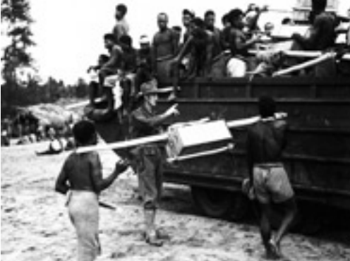
(1940s) Colonial soldiers for the Allied Signal Corps line in the mountains of New Guinea