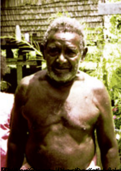
Photo of a man who lived on the President Islands, Kennedy live of John F.