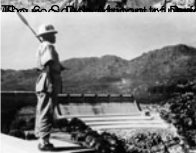
South African Department of Defence Documentation Centre, Pretoria)