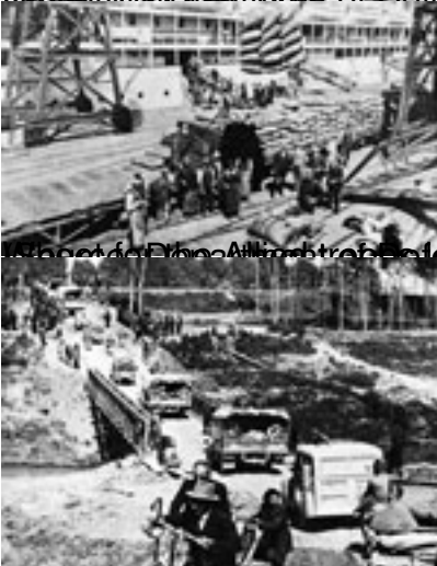
South African Department of Defence Documentation Centre, Pretoria)