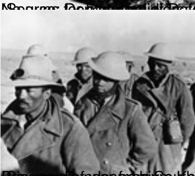
South African Department of Defence Documentation Centre, Pretoria) (Seite 88 unten)