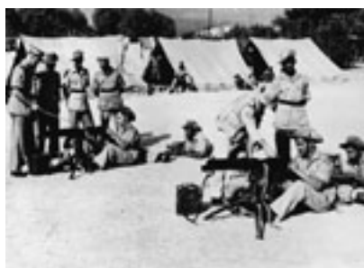
Training of soldiers of the Cape Corps