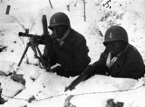
(1944) Colonial SLD from Africa in winter 1944 in Northern France