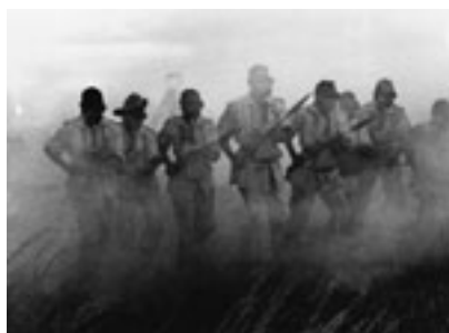
Preparation of soldiers from South Africa for attacks with poison gas by Italian troops in Ethiopia